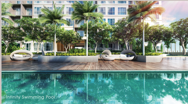
Infinity Swimming Pool