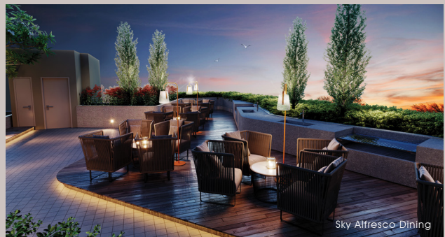
Sky Alfresco Dining